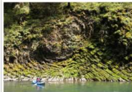
The amazing basalt rosette on the Molalla.

All but about one mile of the waterway is already in public ownership. It is managed by the federal Bureau of Land Management and is known as the